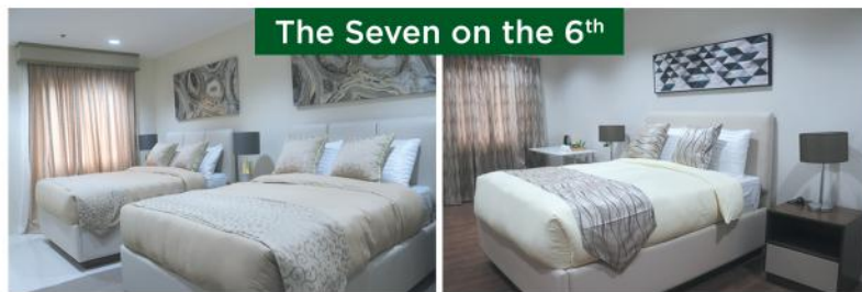
The Seven on the 6 th