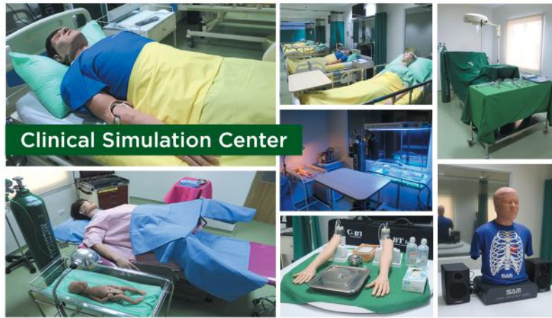
Clinical Simulation Center